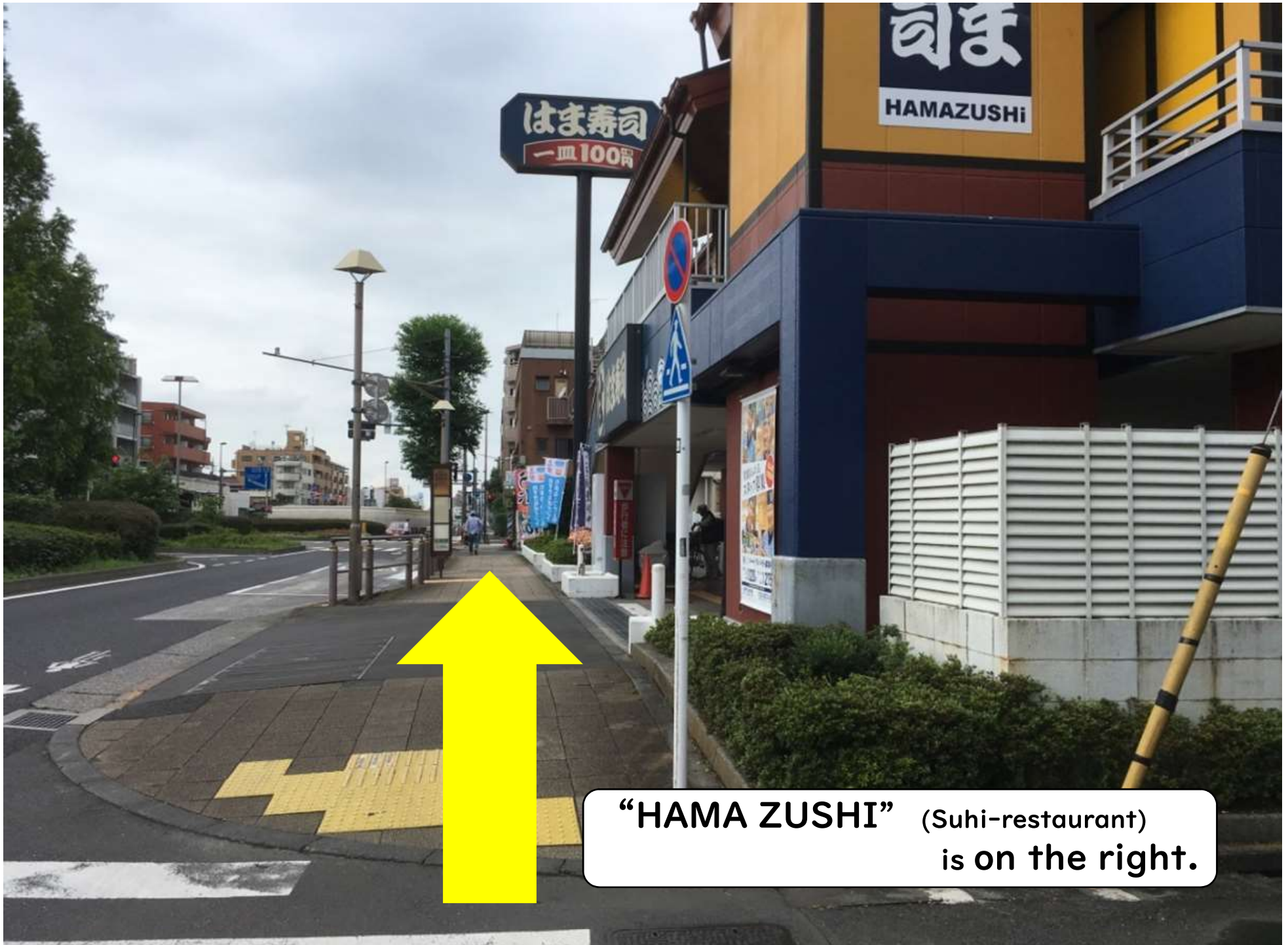
“HAMA ZUSHI” (Suhi-restaurant) is on the right.